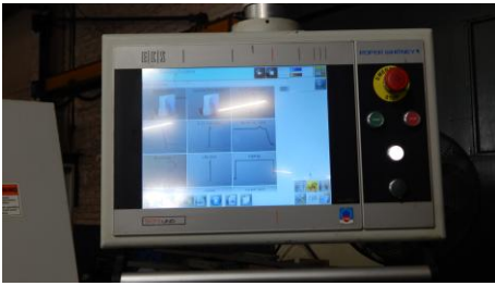
AB1014 comes with an ECS touch screen.